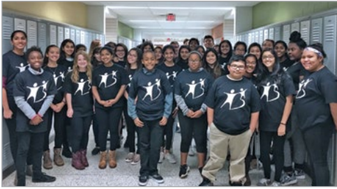
Wrapping Up the Successful Pilot Year of Biotechnology High School Mentoring Program with Long Branch Middle School!

Our six School Based and four Beyond School Walls programs have all wrapped up this month after a successful year of mentoring! We look forward to planning next year's activities and starting a new program with Colonia High School & Colonia Middle School this fall.